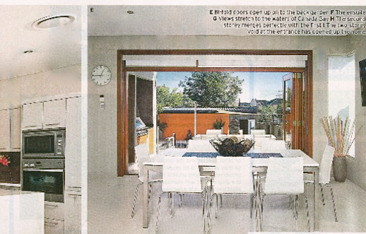
▶ Bifold doors open up to the back of the property. The entrance views stretch to the water of Coode Bay. The second-storey bedroom perfectly aligns with the full view, which is viewed from the entrance has covered up by the house.